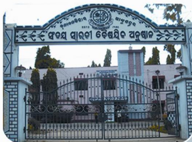
P.G. in Journalism, ITI Brahmapur