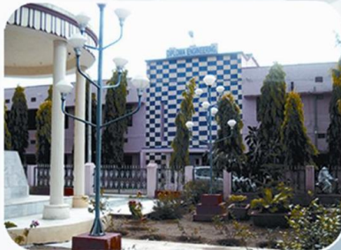
Diploma Engineering Ankushpur, Brahmapur