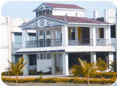
Degree Engineering (B.Tech.), M.Tech. Chandipadar, Brahmapur