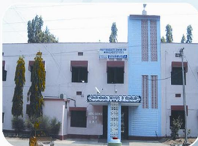
P.G. in Rural Management, M. Lib., B. Lib. Ankushpur, Brahmapur

👑 +2 Science College, English Medium School, ITC